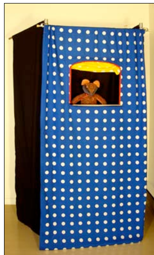
Front View - Full Height