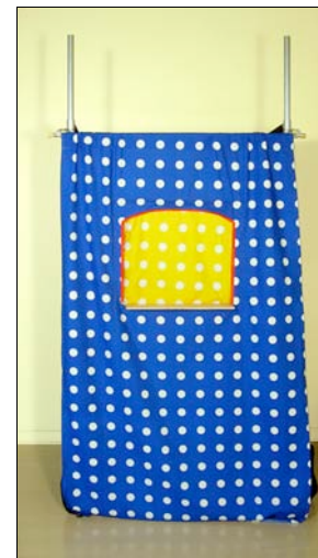
Front View - Lowered

The PPT-MINI is a free-standing, height-adjustable portable puppet theatre suitable for adult and children puppeteers that features our Doorway Theatre. It's like having two theatres in one! Perfect for classrooms without an available doorway and suitable for smaller performers the PPT-MINI is constructed from aluminum and can be assembled in under 10 minutes. Choose the basic package, which includes the frame and doorway theatre or add on a stage, adjustable wings or backdrop as your budget allows. If you already have a doorway theatre just purchase the frame and other components as desired.