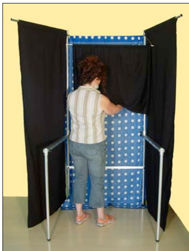
Rear View with wings and backdrop