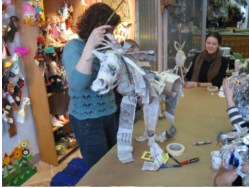
A newspaper horse

One day workshop, Friday August 7, 10.00 a.m.- 4.00 p.m. $60