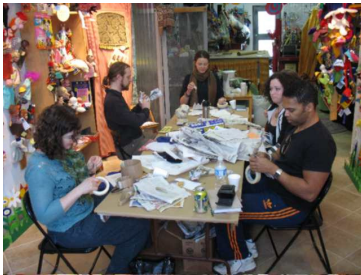
Workshop in Toronto

http://web.me.com/jamesashby/Bricoteer_Puppetry_Project/Welcome.html