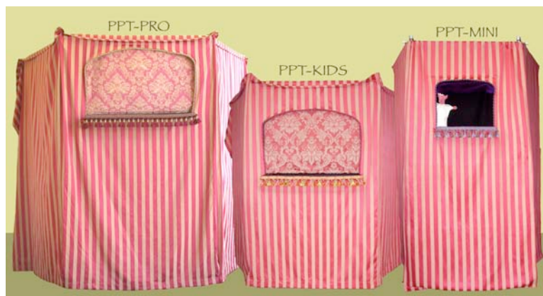
Open Door Designs Portable Puppet Theatres

Open Door Designs' free-standing theatres are specifically designed for libraries, classrooms and professional performers. They assemble in minutes and store in a wheeled carry bag for ultimate portability. Open Door Designs' theatres are now in libraries, schools and institutions across North America and in Europe with applications as diverse as literacy, environmental education, a prop in the Nutcracker Ballet and creative play. Clients are also very varied: The Paddling Puppeteer, NFLD Department of Natural Resources; Burnaby School District #41, BC; City of Loveland, Colorado; Toronto Public Library; Tlingit Family Learning Centre, Atlin, BC; Marine Park, Ustica, Italy.