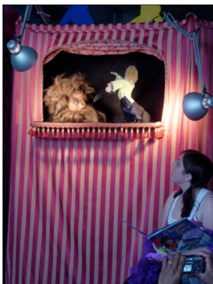
The PPT-Pro in action at Open Door Designs. Little Feste Presents performed by Puppets Without Borders .