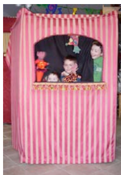
The PPT-Kids the child-sized PPT