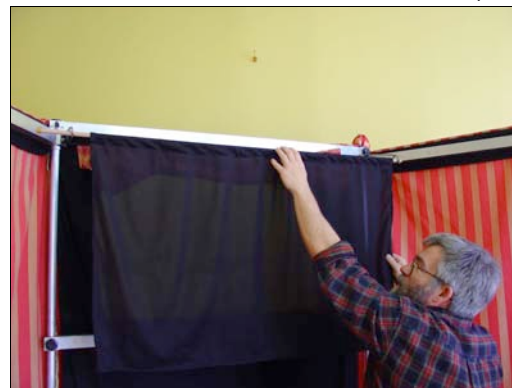
Scrim suspends from hangers