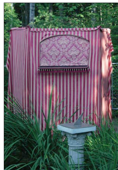
The PPT-Pro has tie down loops so that it can be pegged securely to the ground at outdoor venues.

For a demonstration or additional information please contact us